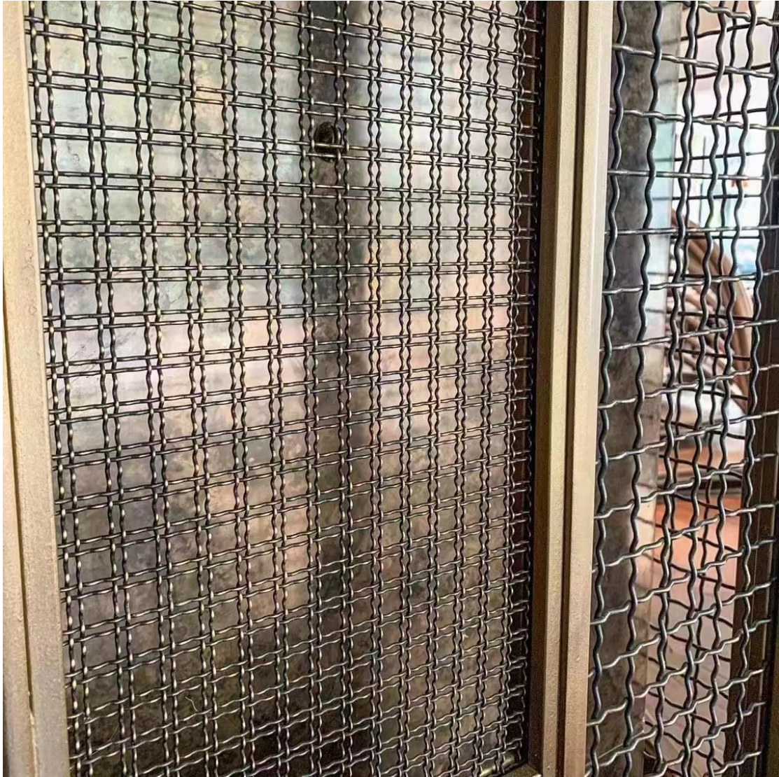
An example of partition:fix the mesh in the middle of frame